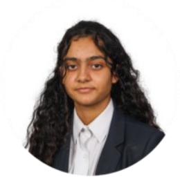
SPARX Maths leaderboard: