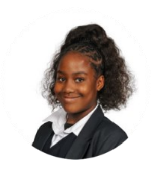
SPARX Reader leaderboard: